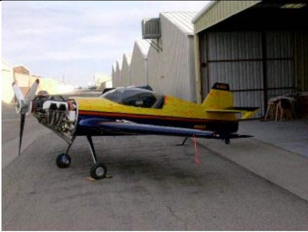
Returning from some taxi tests.

Thanks for the comments. More to follow.