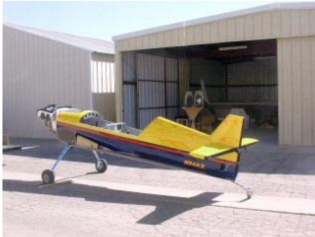
ARRIVAL AT MOJAVE! WINGS IN THE BACKGROUND ("Velocity" project way in the back)

I will get a project fact sheet out next email to cover any FAQs.