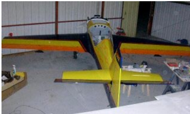
COLD NIGHT IN MOJAVE HANGAR