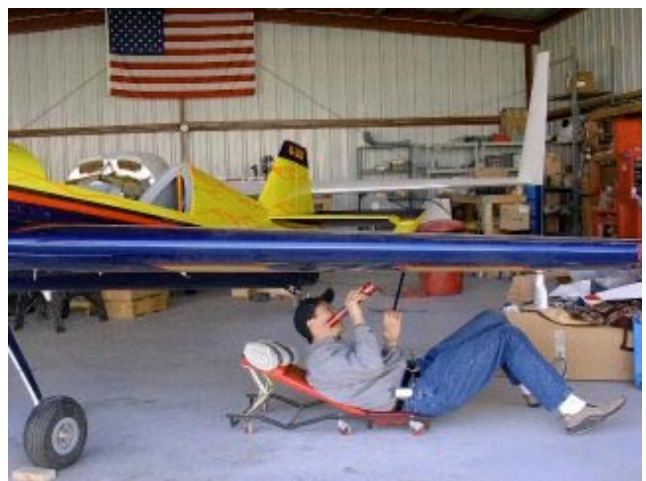
DAR inspecting the aileron attachments.

Next up high power runs with cowlings installed to check cooling.